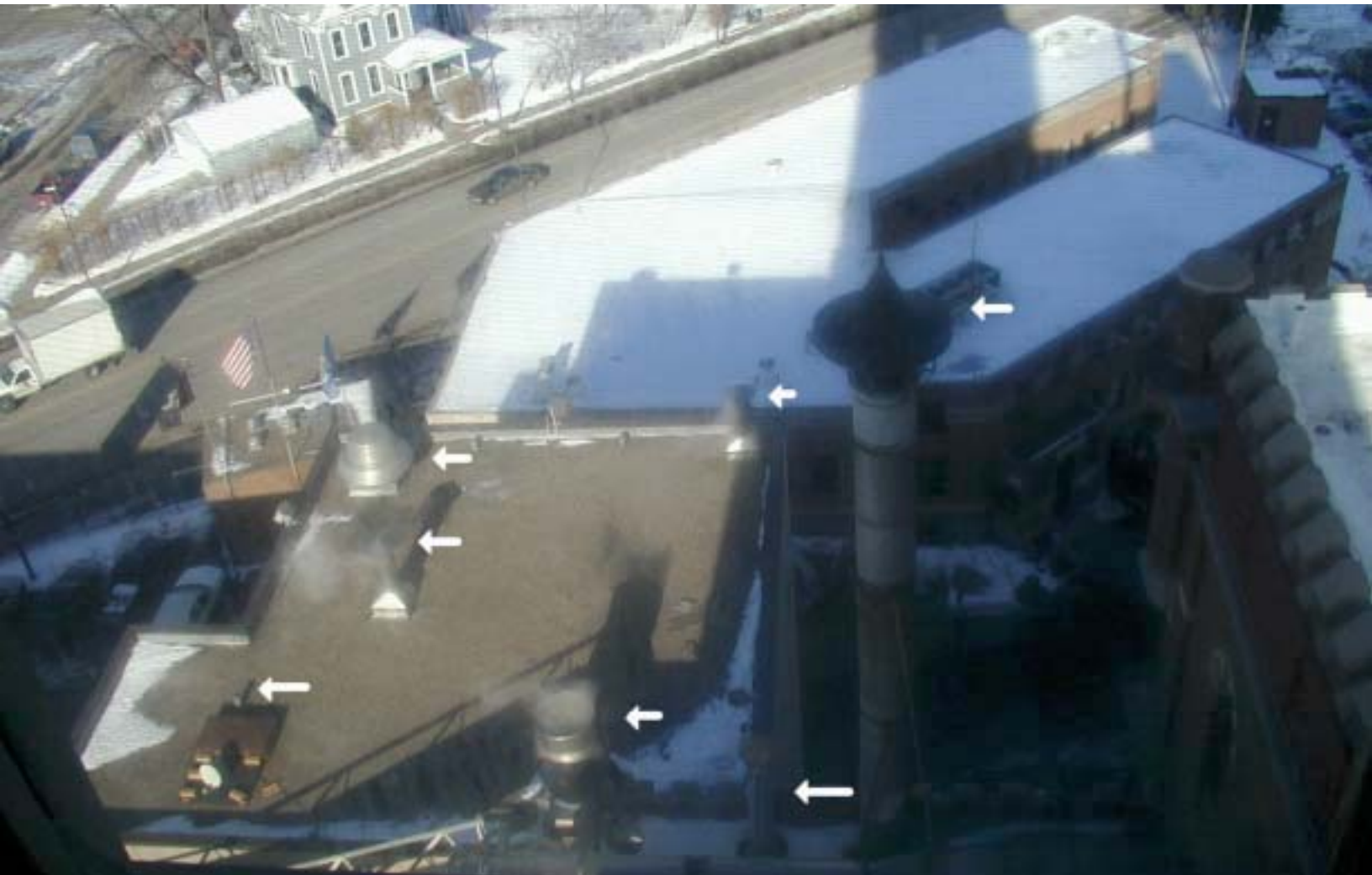
Uncharacterized Roof Top Vents