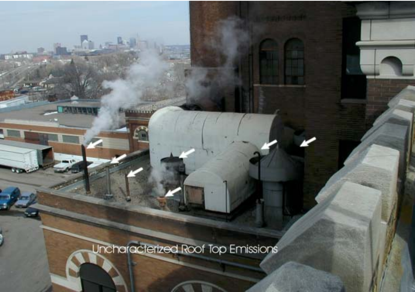
Uncharacterized Roof Top Emissions