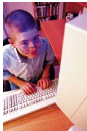
Personal Health Records/ Education/ Directives