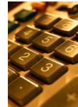
Home Monitoring Device