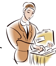
Health Plan Benefits and Claims History