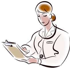
Primary Care Doctors and Specialists