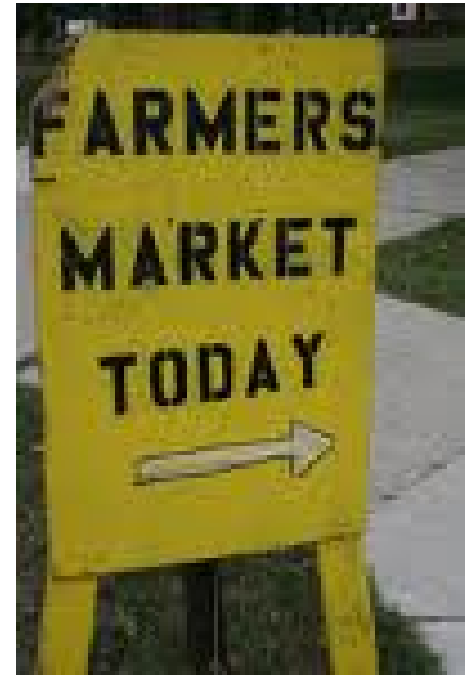
Making a Difference in Minnesota