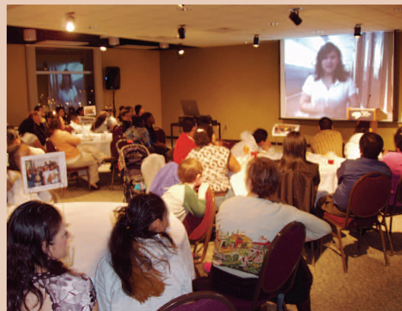
At the Science Museum of Minnesota, the audience views commercials created by Folwell Middle School's Latino Science Club. Their message – science is important!