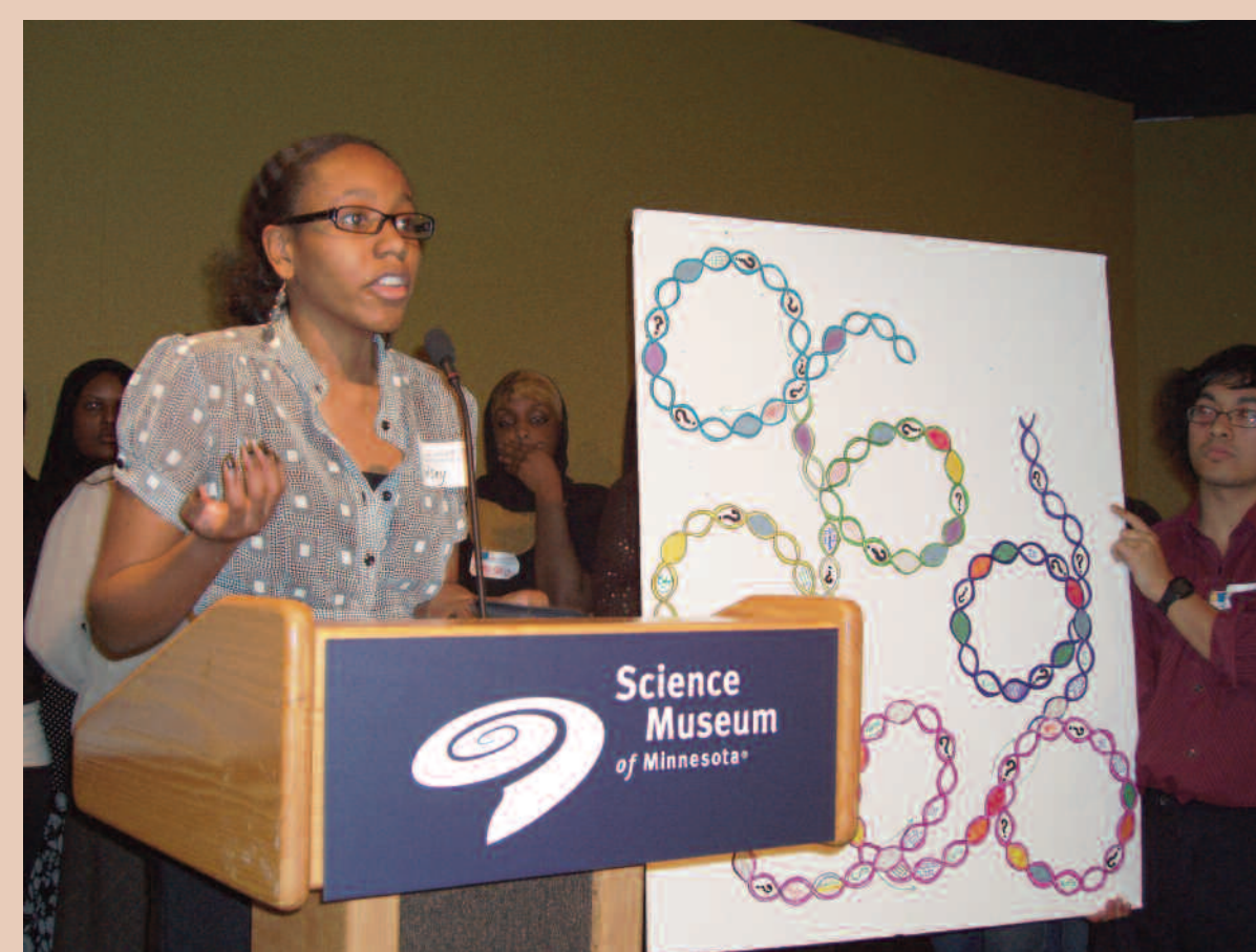
College and high school students offered a creative way to educate young people about genomics. Their "Circles of Life" game gives everyone a chance to see how genetics affect the "Game of Life."

Adolescent health researchers and public health professionals have long recognized the effectiveness of youth development strategies. These are approaches which intentionally meet the developmental needs of young people while empowering them to build skills, competencies and assets.