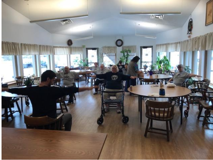
Chair Exercising at Elders Lodge. Minneapolis American Indian Center