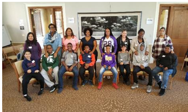
Parents and Teens Communication Workshop. Big Brothers Big Sisters