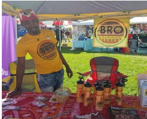
Indirect contacts through community events. African American AIDS Task Force

while others who did education through radio, television, and social media did not estimate their reach. The largest group reached through indirect contacts was American Indian, at more than 182,000 or 67% of the total.