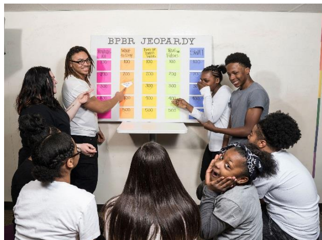
Peer Education in Action. Annex Teen Clinic

Grantees are using a combination of evidence-based programs and culturally responsive practices to most effectively improve sexual health for youth in Minnesota.