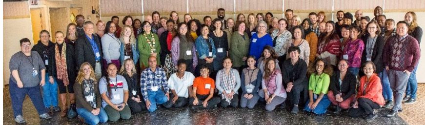
2018 EHD Grantees. MDH

Examples of CoP in-person conversations that Rainbow Research and PRC have facilitated include Design Thinking for grantees to discuss the best ways the CoP could be beneficial to them; three grantee-led opportunities to learn about others' work in the community, resources, and networks; and providing feedback to the design of the EHD Grant Fact Sheets template. 3