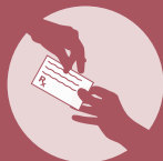
At the Pharmacy