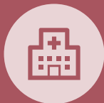
At the Doctor