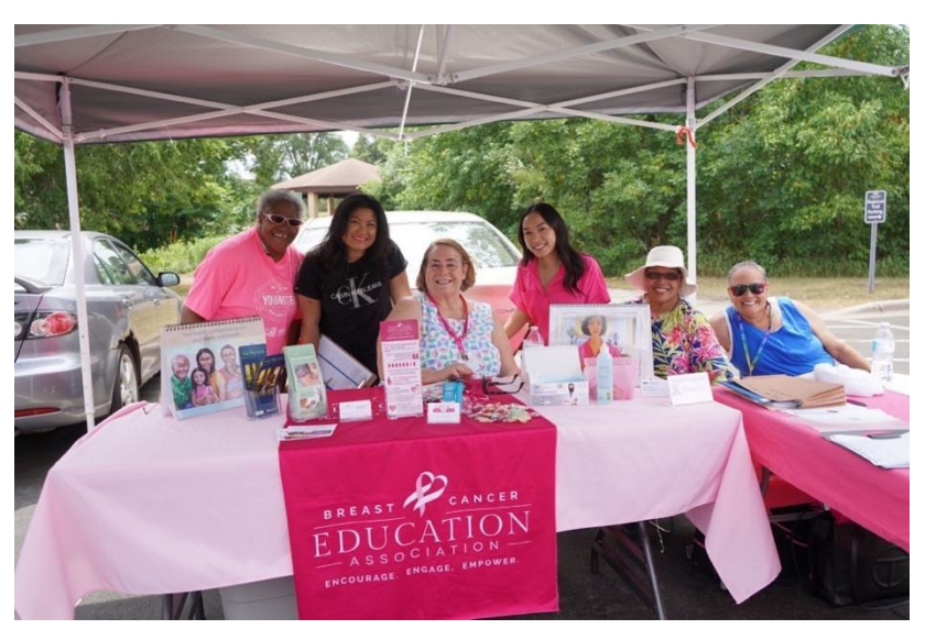
Figure 4: LAO Assistance Center of MN, EHDI Grantee FY 21-22

Ensuring Access to culturally relevant health services for people and families by providing transportation, translation, insurance enrollment, service referrals, or other wrap-around services that help stabilize and address needs that prevent impacted community members from prioritizing health. EHDI grantees also train and coordinate among institutional and policy partners to help them provide culturally relevant, trustworthy, and holistic services.