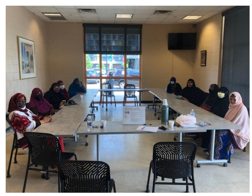
Figure 2: Pillsbury United Communities, EHDI Grantee FY 21-22

Reach categories aim to broadly capture the variety of strategies EHDI grantees employ within their priority health areas. These reporting categories were first used in FY 20, replacing direct and indirect contacts, based on a qualitative analysis<sup>7</sup> of the shared work grantees engaged in before and during the COVID-19 crisis.