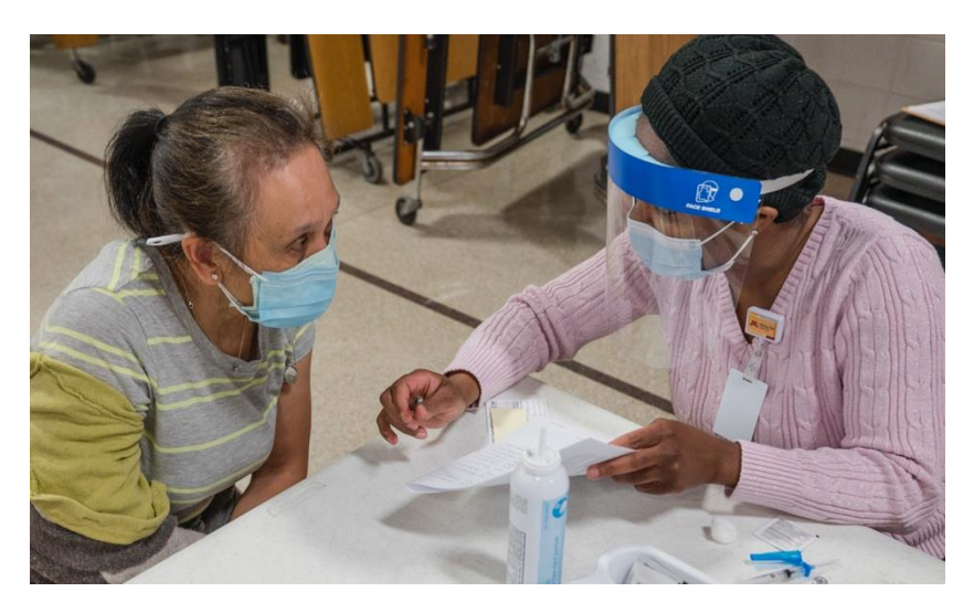
Figure 1: MINI EHDI Grantee FY 20-23

In response to community and stakeholder feedback and based on the EHDI philosophy that all work must be community-driven, the EHDI program allowed grantees to expand programming to go beyond targeting individual-level changes (such as awareness, knowledge, behavior or skill) to focus on broader social determinants of health, such as changing policies, systems or environments that address the root causes of inequities. Beginning in the FY 20-FY 23 grant cycle, EHDI allowed applicants to choose to work within one or more levels of change to address one or more of the PHAs. The three levels of change are: