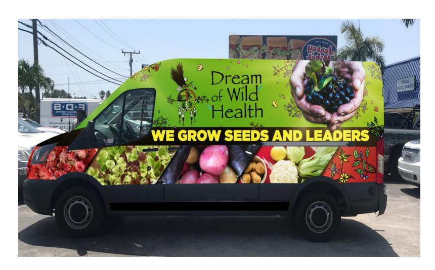
Figure 3: Dream of Wild Health, EHDI Grantee FY 21-22

Ensuring Access to culturally relevant health services for people and families by providing transportation, translation, insurance enrollment, service referrals, or other wrap-around services that help stabilize and address needs that prevent impacted community members from prioritizing health. EHDI grantees also train and coordinate among institutional and policy partners to help them provide culturally relevant, trustworthy, and holistic services.