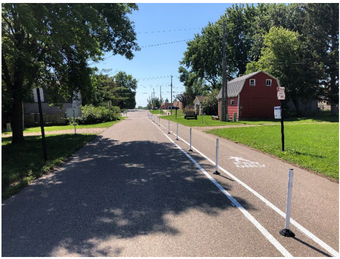
Figure 5: Demonstration Pedestrian Access Lane Example

After the workshop, a subset of workshop attendees met to determine how to use $5,000 of implementation funding and 100 hours of technical assistance from MDH. After considering multiple options, they decided to focus implementation efforts on a demonstration project along Hwy 169. In consultation with MnDOT, the team is designing curb extensions and a temporary on-street pedestrian path on the west Hwy 169 to fill in a sidewalk gap from 3<sup>rd</sup> St SW to 1<sup>st</sup> St SW, as well as curb extensions at the existing crosswalk across Hwy 169 near 1<sup>st</sup> St