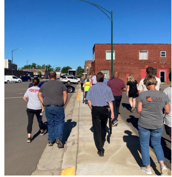
Figure 3: Group Walk Audit

Participants said that the route needs consistently wide