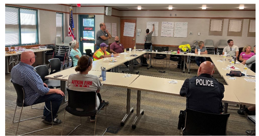
Figure 4: Brainstorming Action Steps at Workshop

Highway 210 and Highway 169 are scheduled for reconstruction in 2030, presenting an opportunity to overcome many of the barriers to walking in Aitkin.