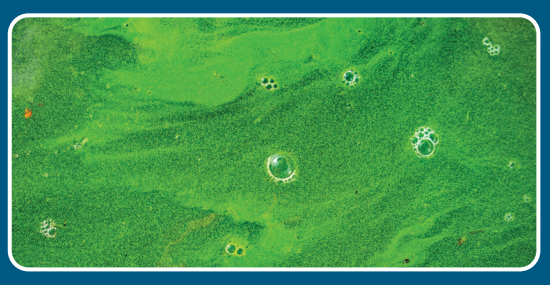
As the bloom dies off, it may smell like rotting plants .