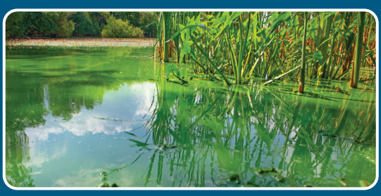
Foam, scum, mats, or paint-like streaks on the water's surface