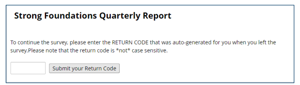
Figure 6. Screen where the Return Code is entered.

When you are ready to continue the form, open the link for returning to the survey, and enter the Return Code (Figure 6). This should open the form with your saved data.