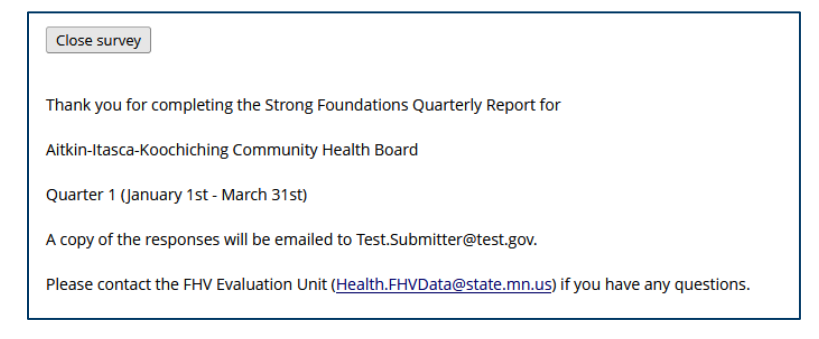
Figure 1. Screen displayed when the Strong Foundations Quarterly Report is completed.

A confirmation email will be sent to the email address of the person completing the form. This email will include the responses given to questions on the report for your records.