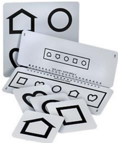
LEA SYMBOLS® MASS Vat Flip chart