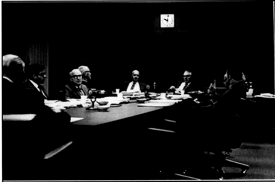
State Board of Health Meeting, 1971